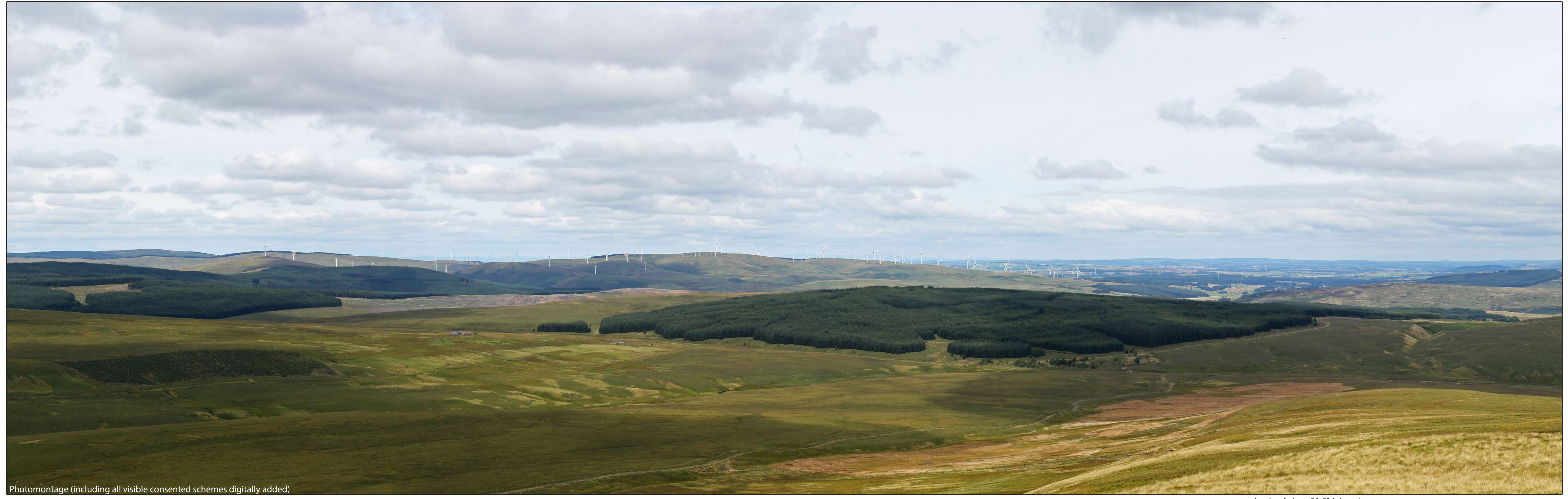
Figure 6.42 (sheet D) Viewpoint 11: Cairn Kinney DOUGLAS WEST WIND FARM EXTENSION