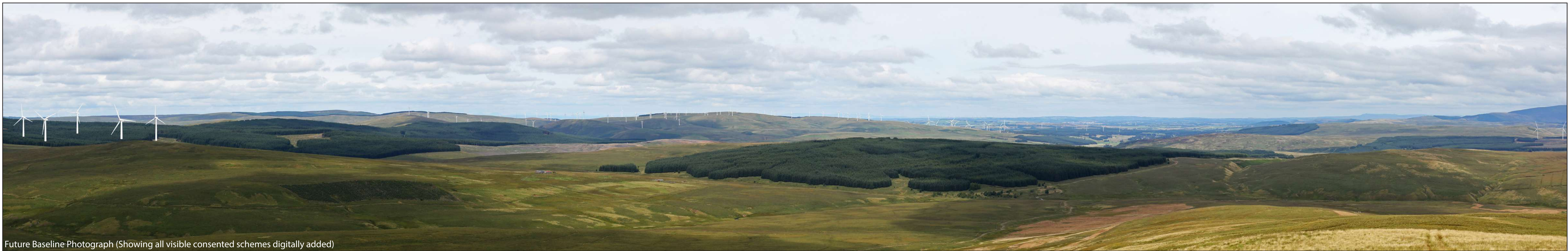
Figure 6.42 (sheet A) Viewpoint 11: Cairn Kinney DOUGLAS WEST WIND FARM EXTENSION